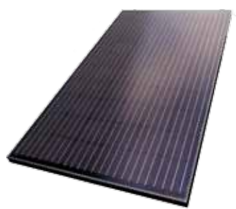
BlackBlack Also available with black backsheet and frame